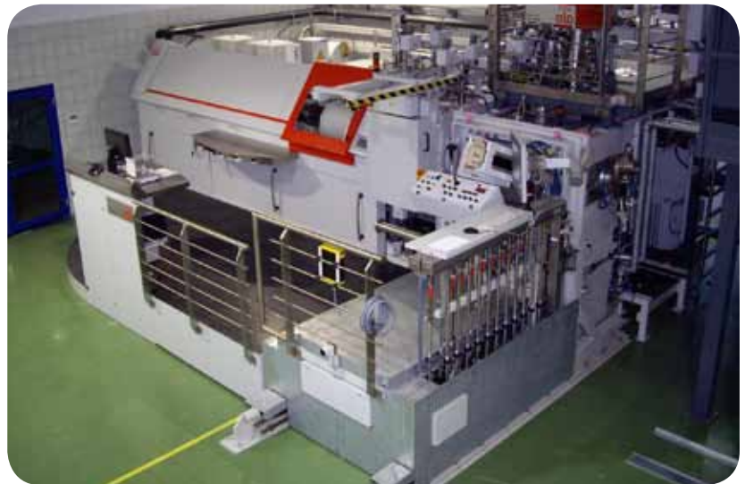
The new SmartCoater expands ALD's product portfolio